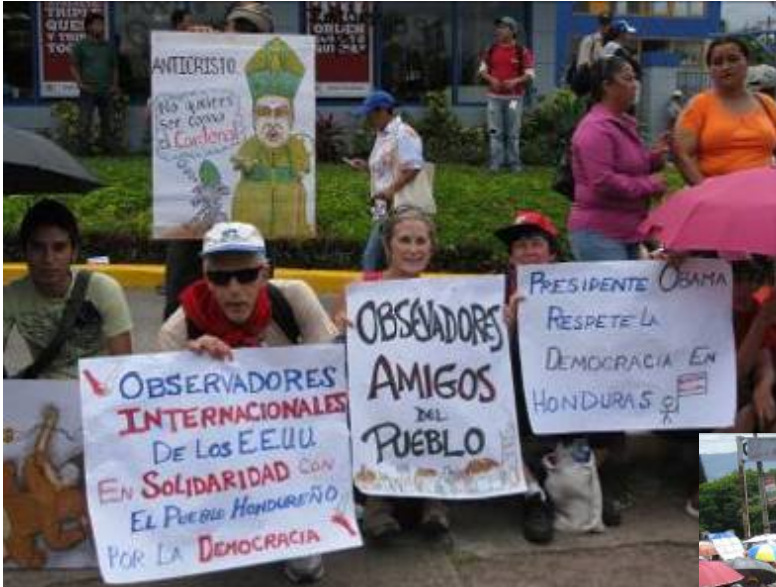
Photos from August 11 Mass Demonstration