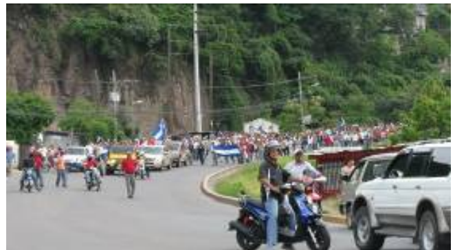
A part of the August 11 th march came from Olancho, a six-day walk.