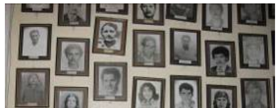
Wall of 1980s disappeared at COFADEH